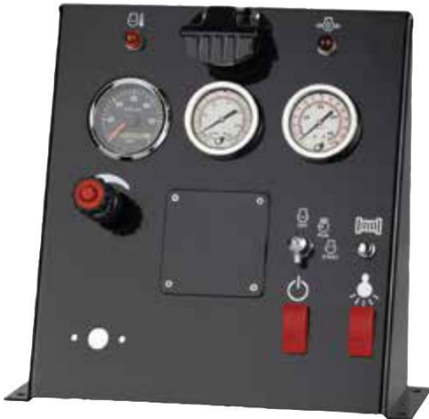
168-00050-000 PPK Panel, Kubota