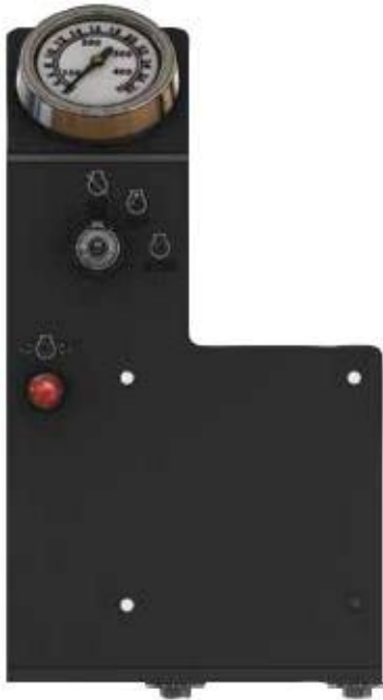
168-00049-075 T Panel, Yanmar